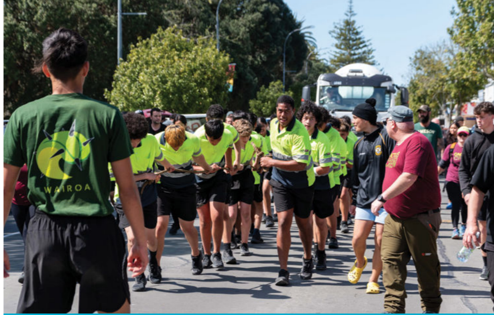
CACTUS Programme participants putting their best foot forward.

The CACTUS programme has sat at the heart of WYAT for two decades. The elite, volunteer driven initiative offers an eight week leadership and life skills training programme for young people at Wairoa College, with two intakes graduating each year.