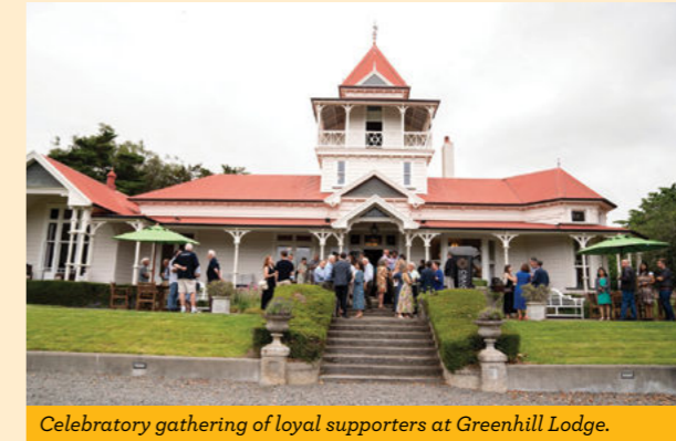
Celebratory gathering of loyal supporters at Greenhill Lodge.

efforts, supporting vital community projects and initiatives across the region. Our shared commitment to fostering long-term social good aligns perfectly with the Foundation's mission, and we look forward to continuing to contribute to the betterment of the Hawke's Bay community for years to come."