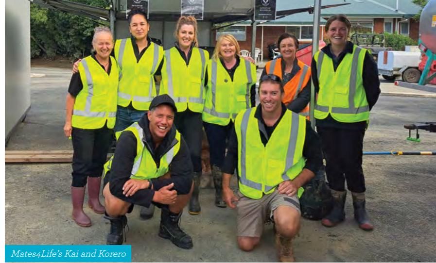
Mates4Life's Kai and Korero