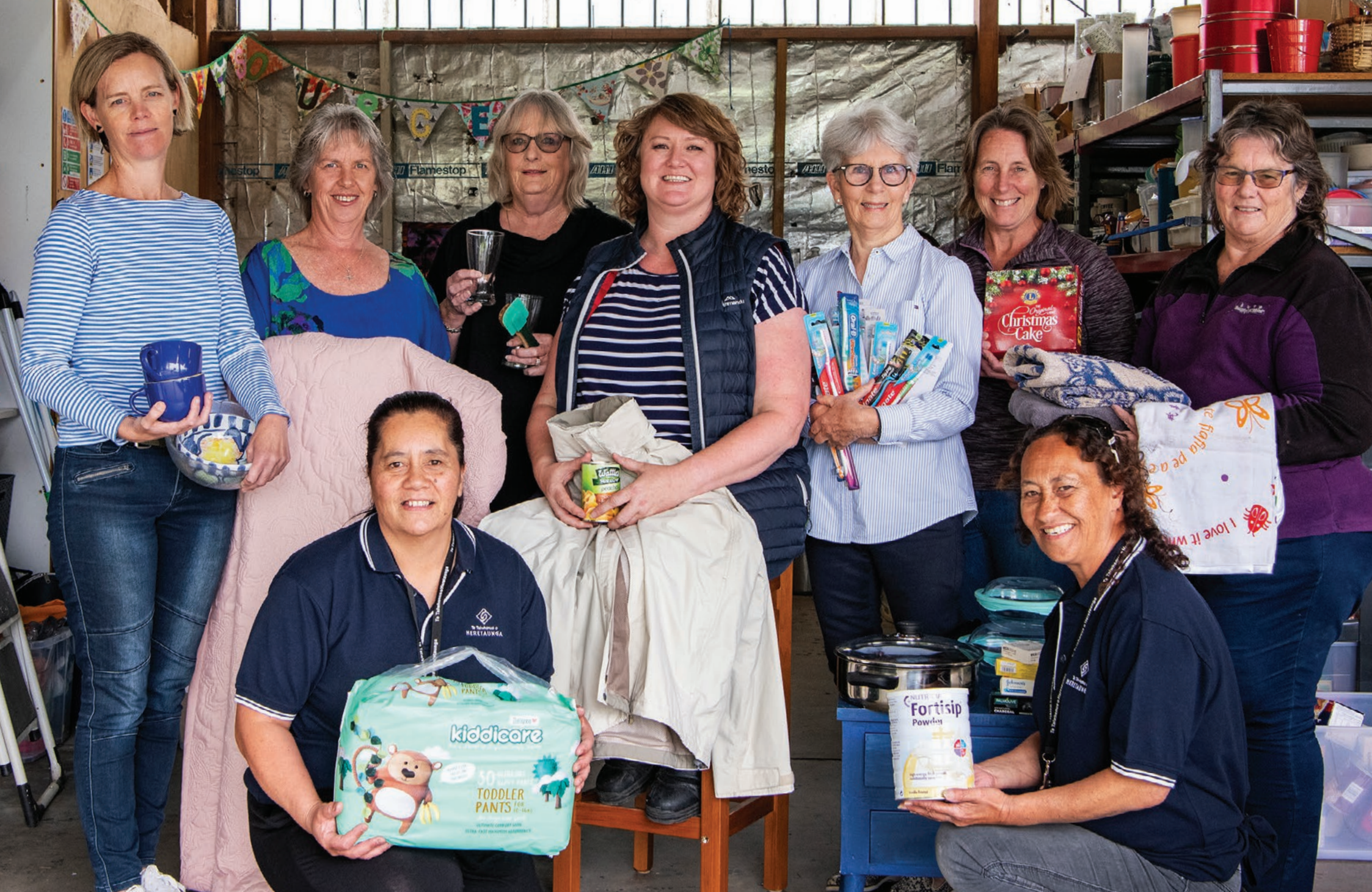
Re-Source received a $4,000 grant from Hawke's Bay Foundation to help fund the purchase of a van, to help with pick up and deliveries of donated goods.