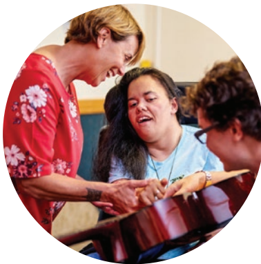
Raukatauri Music Therapy Trust

Hawke's Bay Foundation uses 1% of the endowment fund for operational costs with the balance of operations funding derived from donations and sponsorship. All funds were invested in compliance with our SIPO.