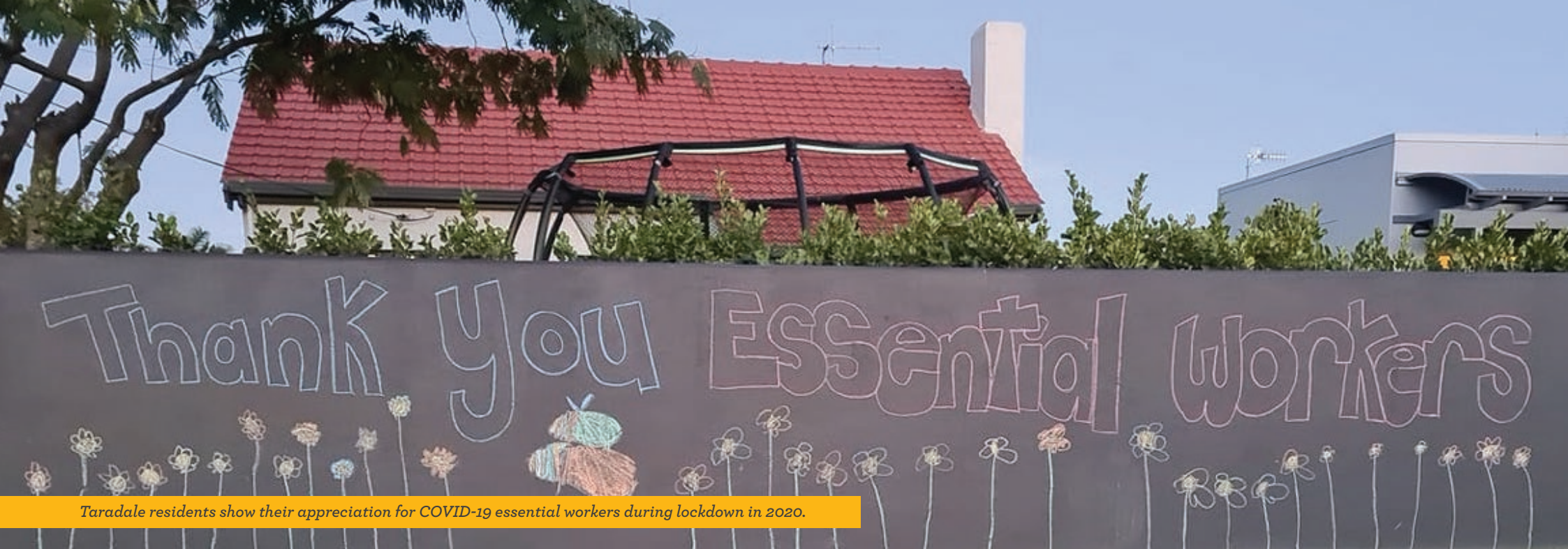
Taradale residents show their appreciation for COVID-19 essential workers during lockdown in 2020.