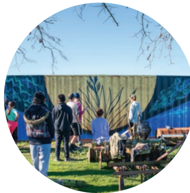
Youth Development Trust 'Coming to Life'